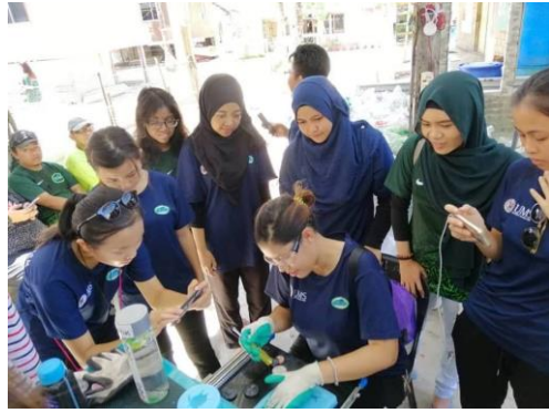
Plastic recycling demonstration