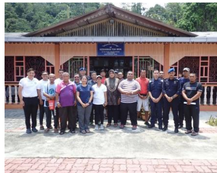
The Sibul-Tinggi Island Co-Management Committee second quarterly meeting