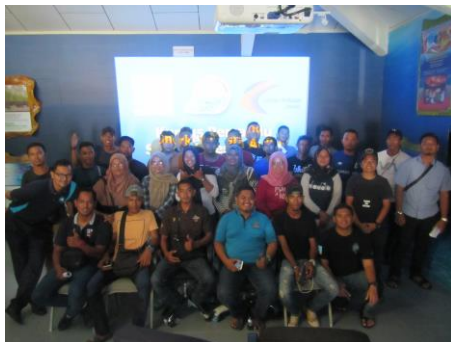
The first Eco-friendly Snorkel Guide course in Mersing

We also conducted the Sibul-Tinggi Island Co-Management Committee second quarterly meeting in Pulau Tinggi, at the end of April. This meeting was to discuss the local issues and planned activities for 2019. The committee agreed to more capacity building and training programmes for communities such as the Eco-friendly Snorkel Guide training, development of new tourism-based supplementary livelihood, and to participate in the International Coastal Cleanup event in September. Those present at the meeting were representatives from Marine Parks, Mersing District Council, Marine Police, APMM, Mersing District Office, resort operators from Sibul and Tinggi, and local communities.