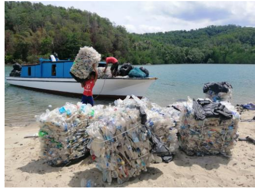
Plastic bottles from MPRC ready to be transported out of the island

Our plastic bottles collection effort from house-to-house is still ongoing. Since January 2019 until end of June 2019, approximately 36,000 of plastic bottles has been prevented for ending up on the sea through this weekly collection done on the island.