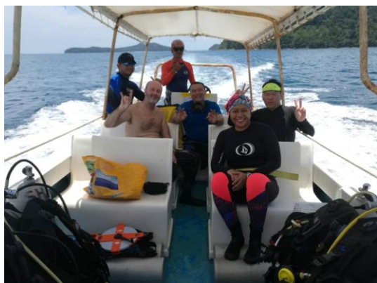
The team that conducted the Usukan Cove surveys

For the first half of this year, we have certified 28 new EcoDives with help from Reef Check EcoDiver trainers in SeaVoice Divers, Juara Turtle Project and DM Scuba.